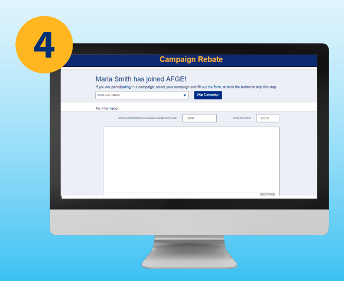
If you're a new member, select a rebate campaign and fill out the brief form (local participation may vary)