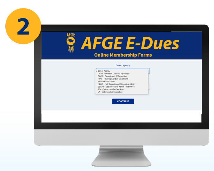
Select your Agency and Local Number