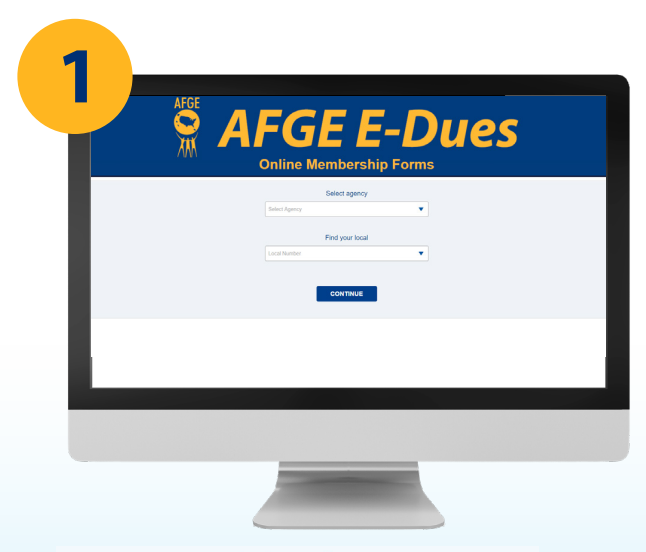
Go to www.join.afge.org/L2004

THIS IS URGENT!!!! You have been kicked out of your Union!!!! This is a brazen attempt to silence your voice at work and stop your union from defending your pay and retirement. We can't let them get away with this. You can stay a member of your union by signing up to pay your union dues online through a system called AFGE E-Dues. Follow these simple instructions to stay a member of your union by signing up for AFGE E-Dues using a credit card, debit card, or bank draft: